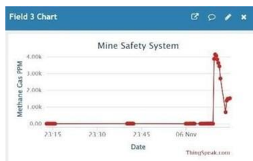
Fig 4: Methane Gas Data displayed on ThingSpeak