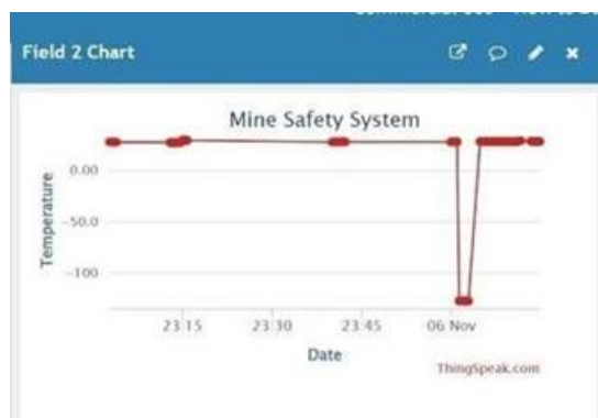
Fig 7: Temperature Data displayed on ThingSpeak