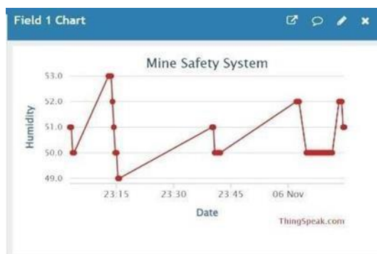
Fig 6: Humidity Data displayed on ThingSpeak