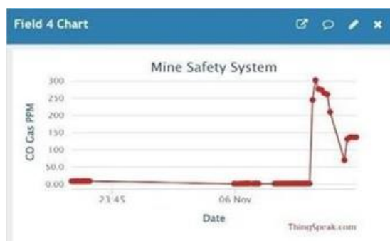
Fig 5: CO Gas Data displayed on ThingSpeak