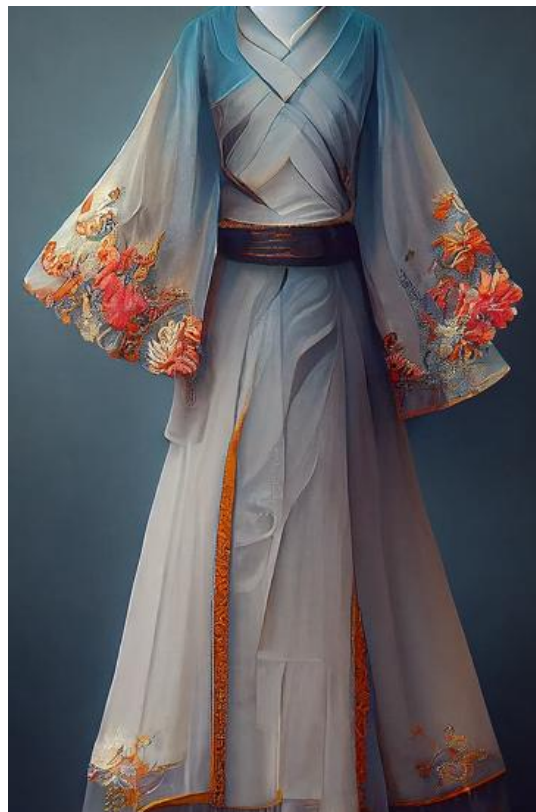
Figure 3. Tang Dynasty Costume Developed by AI