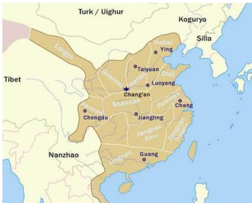
Figure 1. Historical Map of Tang Dynasty

The Tang Dynasty, from 618 to 907 CE, was a significant cultural, social, and historical period in China (Figure 1). Many consider the Tang Dynasty a "Golden Age" in Chinese history (Fan, Wang, & Xiao, 2021). Art and intelligence blossomed throughout this time. It produced some of China's greatest art. Poetry and painting revived. Contemporary artists are inspired by Wu Daozi's captivating works. Li Bai's lyrical poetry delighted readers worldwide (W. Chen, 2023; Dynasties, Wang, & Phungamdee, 2022).