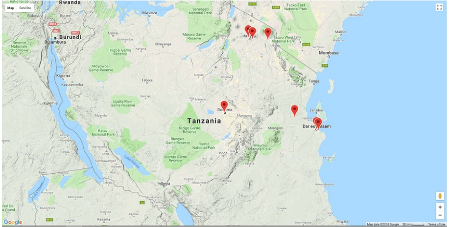
Figure 3. Map for Locating Counterfeits

that shall provide the service of pesticides products authenticity verification also reporting problems/complaints for products which haven't worked as expected.