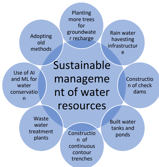
Figure 2 : Ways towards sustainable management of water resources

A number of projects have been undertaken across the globe to resolve the problem of the water crisis and adopt sustainable water management systems so that during the dry season we have enough water for cultivation and drinking. Due to climate change, there has been a change in the pattern of rainfall, which is affecting the agriculture sector. Today, both men and women are working together to resolve the problem of water resources management. Watershed development, water harvesting infrastructure, check dams, percolates, and continuous contour trenches in the Garvadi region are some of the projects that have been implemented to address the issue of water crisis management in the villages of Maharashtra, India. Several permaculture initiatives have been launched to implement new methods of water management. The villages can't survive without the groundwater. Stable groundwater recharge, like that occurring in the Velu district [10], is essential to meeting the region's demand for a reliable water supply. In Africa, in the sub-Saharan region of Niger, the desert is converted into farmland to promote agriculture and reduce the food crisis through Farmers Managed Natural Regeneration (FMNR). Arvari River Restoration in Rajasthan; Chikuama Project in Africa; Turning forest pruning in California into biochar; in East Africa, more than 20 million trees have been planned to reduce carbon footprints.